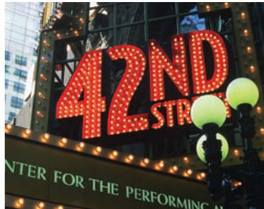
Approximately 36 theaters offering world-renown "Broadway" productions wow patrons nightly in the small slice of Manhattan known as the Theater District.

When most people think of New York City, they envision the bright lights, tall buildings and bustling crowds of Times Square and the Theater District. Midtown West, which sprawls from