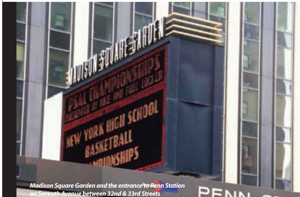
Madison Square Garden and the entrance to Penn Station on Seventh Avenue between 32nd & 33rd Streets

Madison Square Garden , at 33rd Street & Seventh Avenue, home to the New York Knicks basketball, and New York Rangers hockey teams, the famous arena has also played host to some of the biggest sporting, music, theater, and political events ever to take place in Manhattan.