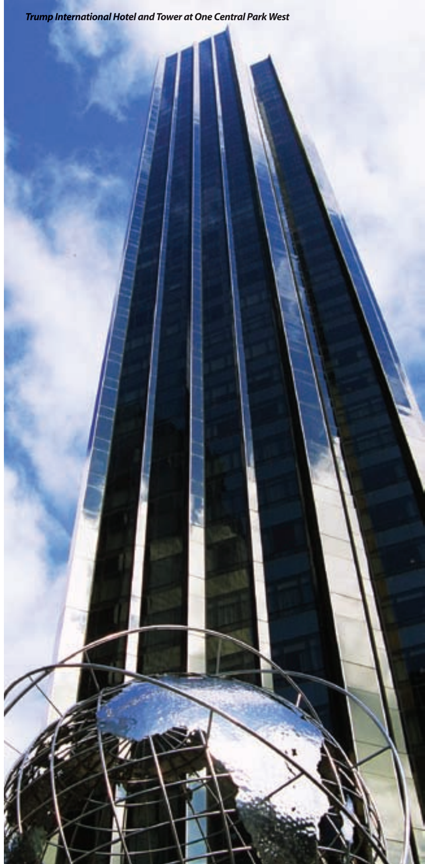
Trump International Hotel and Tower at One Central Park West

Bryant Park Grill , 25 West 40th Street between Fifth & Sixth Avenues. Grafted onto the New York Public Library in Midtown's Bryant Park, this stylish eatery regularly draws seasonal tourists and business lunchers to its