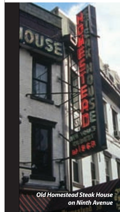
Old Homestead Steak House on Ninth Avenue

Rocking Horse Café Mexicano , 182 Eighth Avenue between 19th & 20th Streets. Fresh tortillas, potent margaritas and funky corn husk light fixtures put this vibrant restaurant a step above the others in the area.