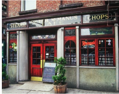
A revitalized Chelsea, which is experiencing yet another rebirth thanks to projects like the Chelsea Piers Sports and Recreation Complex, is still home to a plethora of classic, working class haunts.

B oldly stationed between West Midtown and the West Village is Chelsea, a neighborhood that has maintained a dynamic personality much like its London Thames-area name-