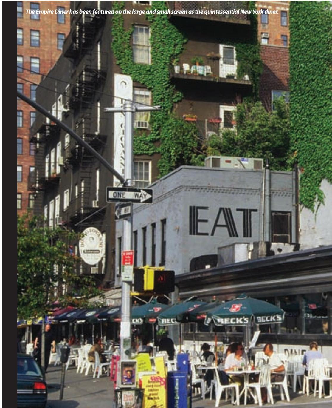
The Empire Diner has been featured on the large and small screen as the quintessential New York diner.

Roller Rinks , offering the perfect venue for friends and families to enjoy the most exciting outdoor activities such as in-line skating, aggressive skating, BMX biking and skateboarding.