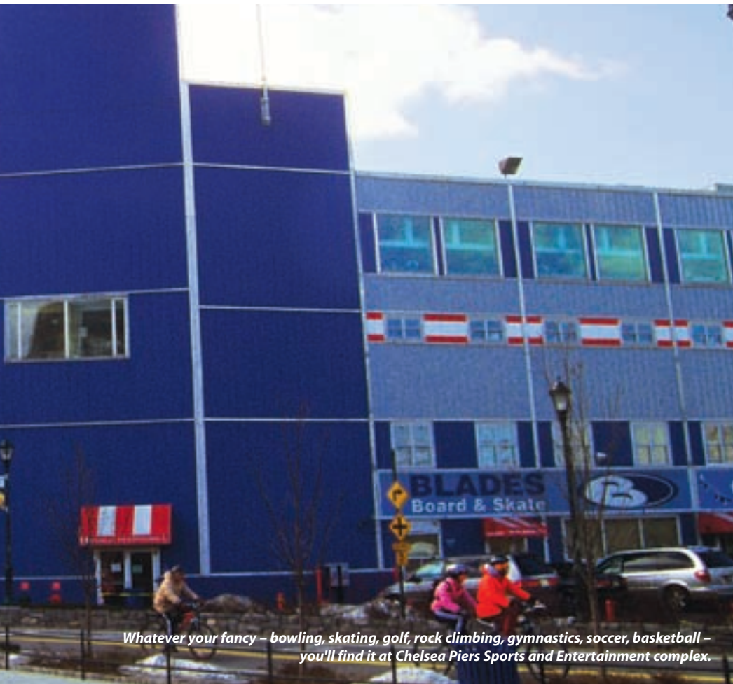
Whatever your fancy – bowling, skating, golf, rock climbing, gymnastics, soccer, basketball – you'll find it at Chelsea Piers Sports and Entertainment complex.

The company was awarded the rights to lease the Chelsea Piers and to create a sports and entertainment facility on the premises. Construction began on July 12, 1994.