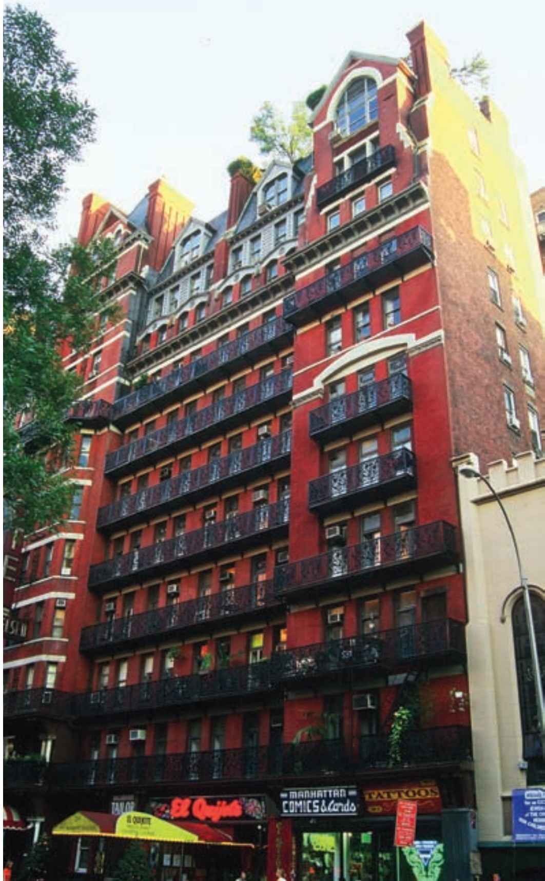
One of the neighborhood's most famous landmarks, The Chelsea Hotel

New York Sports Clubs , 270 Eighth Avenue & 128 Eighth Avenue