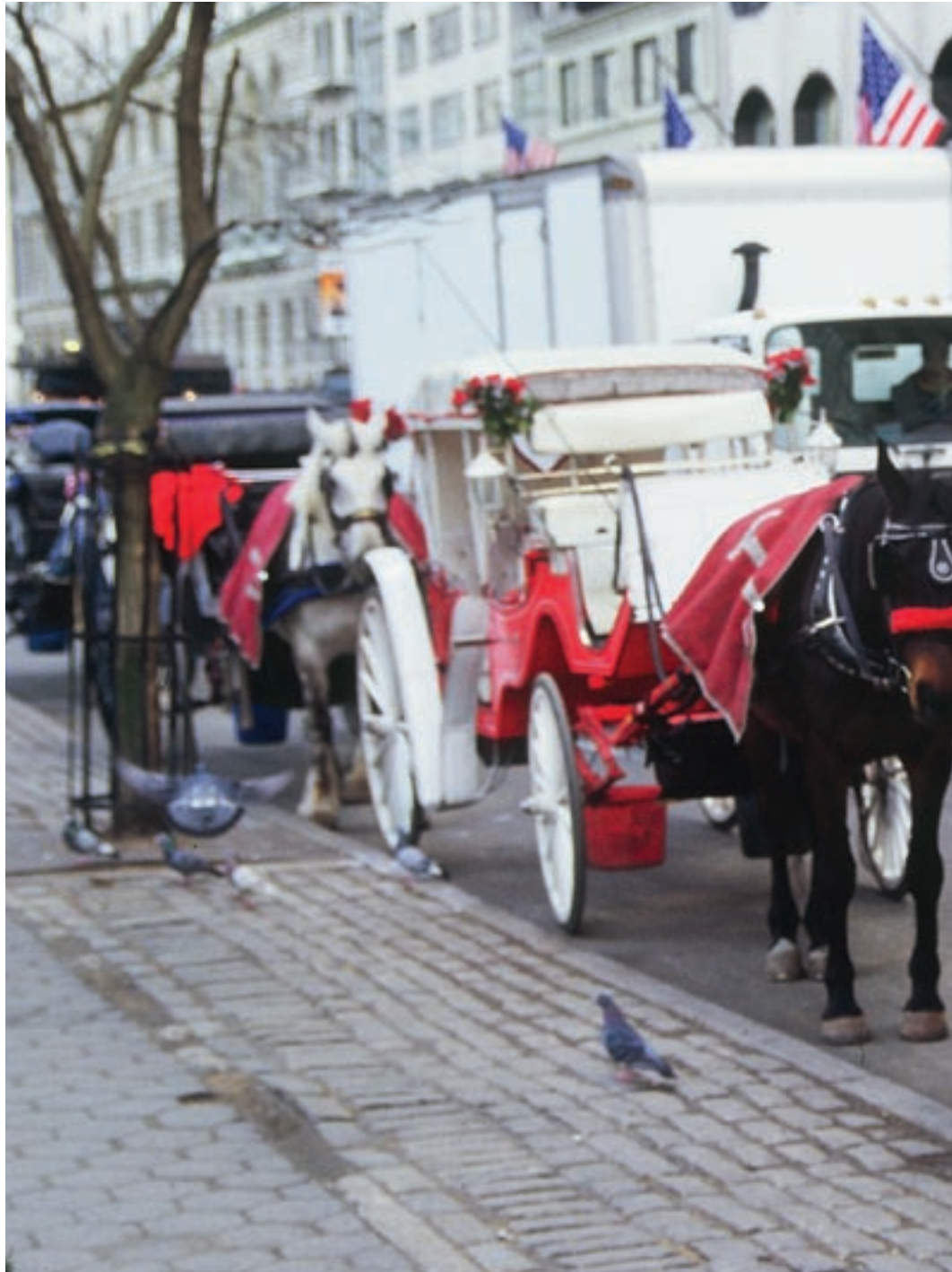
The San Remo